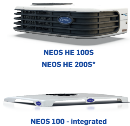
NEOS HE 100S NEOS HE 200S*

In tune with its time, the Neos refrigeration range is expanding and adapting to today's challenges of city delivery with the Neos HE - High Efficiency, offering electric-powered solutions for vehicles up to 12 m 3 . With two installation concepts, Neos can be integrated into the vehicle or fitted externally and is a versatile and reliable choice for customers operating in cities looking for reliability, sustainability and driver comfort.